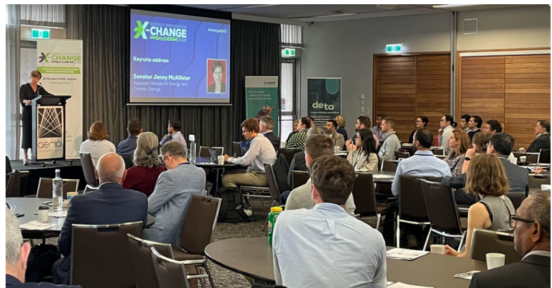
Discounted access to A2EP and industry events