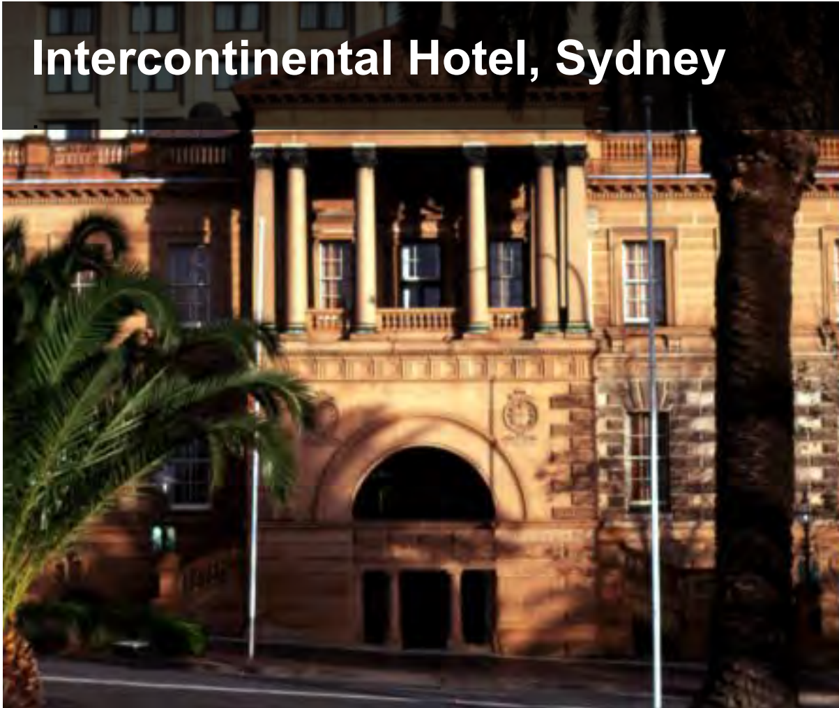
Intercontinental Hotel, Sydney